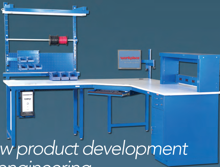
new product development & engineering