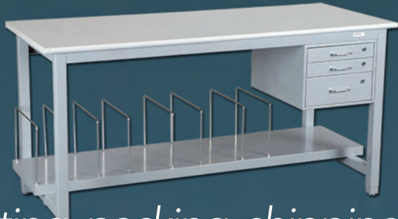
kitting, packing, shipping & receiving