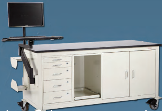
testing & instrumentation