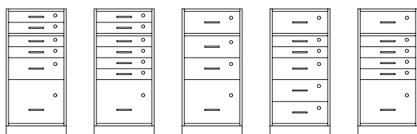
N7055 N7056 N7057 N7058 N7059