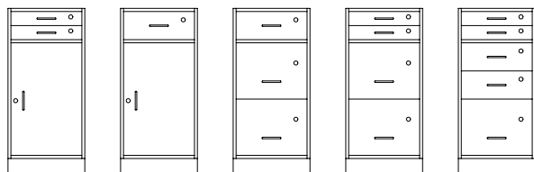
N7050 N7051 N7052 N7053 N7054