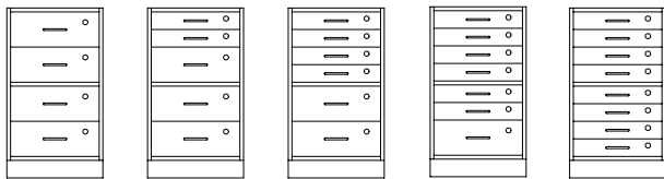
N7015 N7016 N7017 N7018 N7019