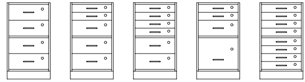
N7035 N7036 N7037 N7038 N7039