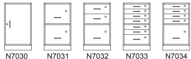
N7030 N7031 N7032 N7033 N7034