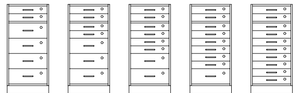
N7060 N7061 N7062 N7063 N7064